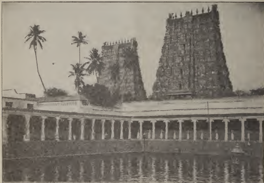
GOLDEN LILY TANK OF MEENATCHI'S TEMPLE

PROBABLY no more splendid example of Hindu architecture exists than that found in the great Meenatchi temple in Madura. Covering a vast area, it holds within its gates great passages and halls, wonderful for carving and ornamental work, the golden lily tank of holy waters wherein the devotees of the goddess and her sacred elephants bathe, statues of "gods